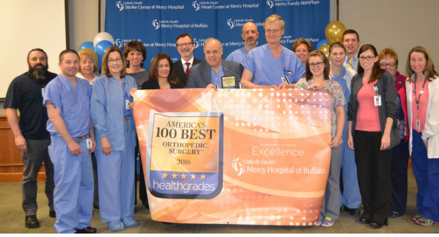
Mercy physicians, nurses and ancillary staff gathered for a special luncheon to celebrate receiving the 2016 America's 100 Best Hospitals Award for Orthopedic Surgery.

Mercy Hospital is proud to be a recipient of HealthGrades 2016 America's 100 Best Hospitals Award for Orthopedic Surgery and to be ranked in the top 5% in nation for Orthopedic Services. The hospital also received 5-star highest quality ratings for total knee replacement, total hip replacement, treatment of hip fracture, and spinal fusion surgery.