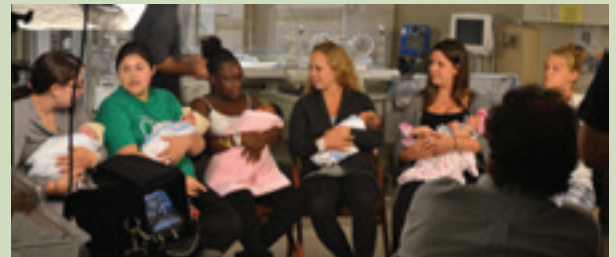
New moms are interviewed by CBS Inside Edition crew during a video shoot in August.

Nine months after the historic Snowvember Storm, Mercy Hospital braced itself for another blizzard—but, this time it was a blizzard of babies! Our mini-baby boom in August sparked the interest of media and newspapers across the country and the world. In addition to news coverage in such major publications as the New York Daily Post , Washington Post , and The Daily Mail in the UK, our baby boomlet was the "talk of the town" on national television.