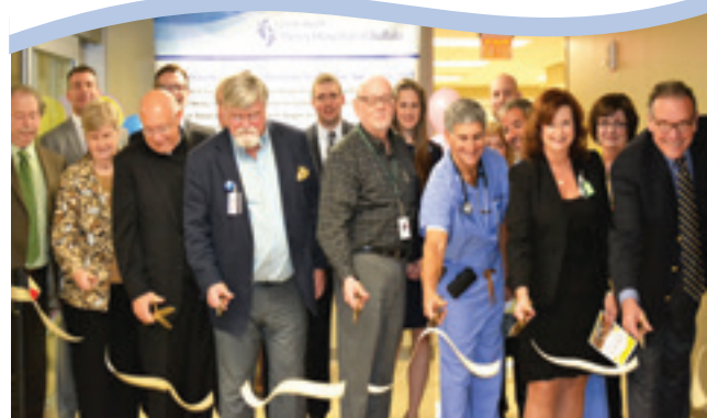
Hospital officials and physicians cut the ribbon on the new Mercy Interventional Unit.

Mercy Hospital held a blessing and dedication ceremony for its new Mercy Interventional Unit (MIU) in April as part of the Hearts Changed & Lives Transformed campaign. The unit serves as a prep and recovery area for patients undergoing minimally invasive procedures in the interventional labs, and features 25 private patient rooms designed to enhance patient comfort. The nearly $5 million project involved the consolidation of two former prep/recovery units into one unit and relocating it closer to the labs on the hospital's second floor.