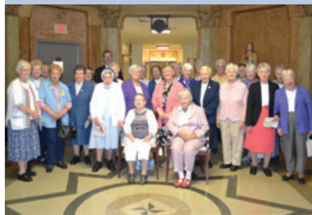
The hospital invited the Sisters of Mercy, who founded Mercy Hospital in 1904, for a Mass and luncheon to celebrate Mercy Day on September 24. Pictured above are a group of sisters who attended the festivities.

Mercy Hospital celebrated Mercy Day on September 24 in honor of the Foundress of the Sisters of Mercy Catherine McAuley who established the first House of Mercy on September 24, 1827 in Dublin, Ireland. Mother Catherine McAuley opened the House of Mercy on September 24 — which is also the Feast of Our Lady of Mercy — to educate young, poor girls and to serve as a residence for homeless girls and women.