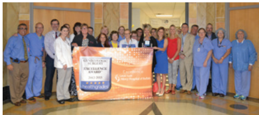
Pictured above, nurses, staff and physicians were presented the HealthGrades Gynecologic Surgery Excellence Award during a recent ceremony.

Mercy Hospital has been named among the top 5% of 836 hospitals evaluated in the United States for providing outstanding performance in gynecologic surgery, as measured by Healthgrades®, the nation's leading online resource for comprehensive information about physicians and hospitals.